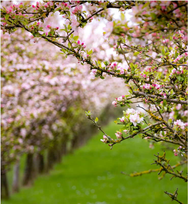
Trees at Coton Orchard have been refused protection orders (TPOs) as the busway means it is 'not expedient'.

The GCP has now submitted a Transport and Works Act Order (TWAO) to the Secretary of State for Transport for authorisation to construct the Cambourne busway (C2C).